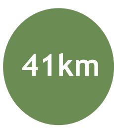
average commuting distance