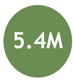
trips per day